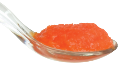
Above: Well mashed carrot

Weaning foods should not contain salt or sugar.