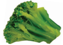
Above: A floret of cooked broccoli