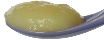
Below: Stewed apple