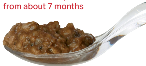
Above: Minced beef