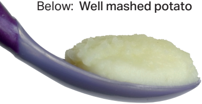
Below: Well mashed potato

At first your baby may be content with small amounts of food for example, only 1–2 teaspoons of mashed food. Use a plastic weaning spoon and half fill it. As your baby learns to take food from a spoon, you will need to increase the amount of solid food you offer. At the same time you will increase the number of times you offer solid foods each day to 2 and then 3 occasions, whether these are finger foods or spoon feeds.