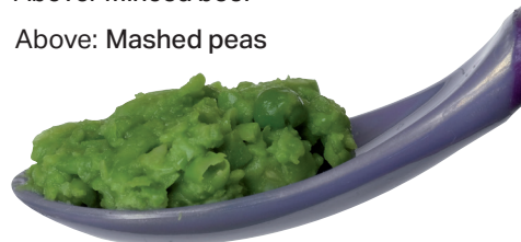
Above: Mashed peas