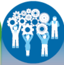
Strengthening the Workforce