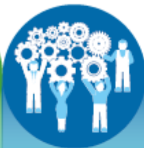
Strengthening the Workforce