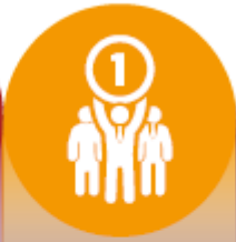
Raising the Standards