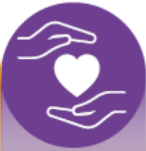
Integrating the Care