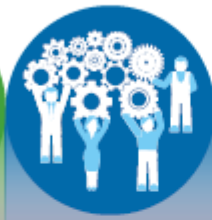
Strengthening the Workforce