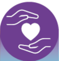
Integrating the Care