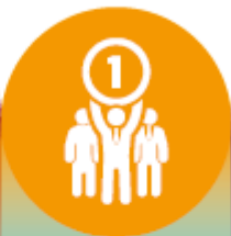
Raising the Standards